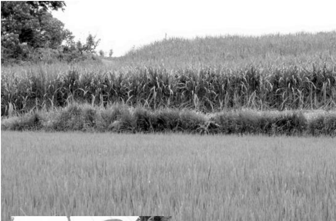
Sugarcane nurseries encroaching on farm lands