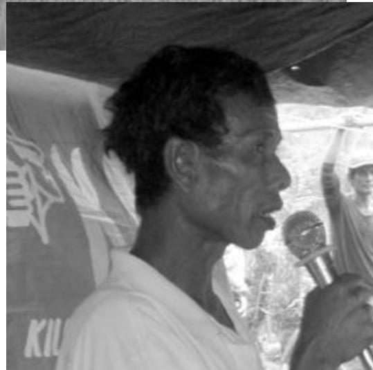
Indigenous Agta leaders testify that ancestral lands were grabbed through application of barangay captain