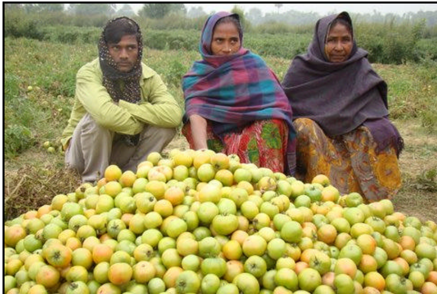
Women will their produce - tomatoes