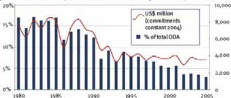
Figure 1: Official Development Assistance (ODA) to agriculture, 1980–2005