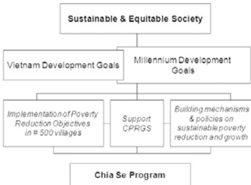
Figure 2. Chia Se Framework

selected provinces – chosen for their high incidence of poverty. These activities generate information and lessons that serve as inputs to the policy-improvement process of the National Government. At the same time, the national project is responsible for supporting the provincial projects in using resources available for poverty alleviation in an effective way, summarising lessons from the field and carrying out necessary studies in order to contribute to policy improvement for the successful implementation of the CPRGS.