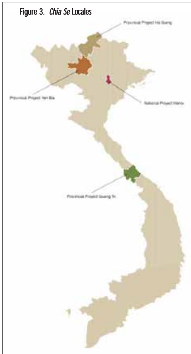
Figure 3. Chia Se Locales

The activities and their outcomes also have to be assessed in terms of their economic, environmental and social feasibility and impact, and the durability of their outcomes. To facilitate this thrust, the sharing of information, open access to information, participation in decision making, and